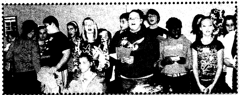
Singing Christmas carols at the Wendell Foster Campus.

KYCEC would like to thank BMS CEC Club for all its activities and membership and wish it prosperity in all its endeavors that lead to a brighter future for children with exceptionalities!