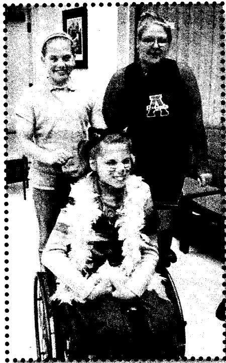
Having fun at the Halloween Sock Hop.