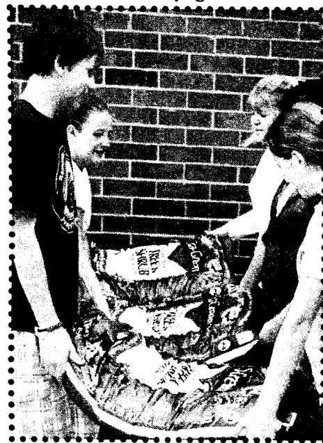
CEC members delivering soil for a tree planting project adopted by students in the special services classes.

44th Exceptional Children's Conference – Nov. 22-24, 2009 Information page 7