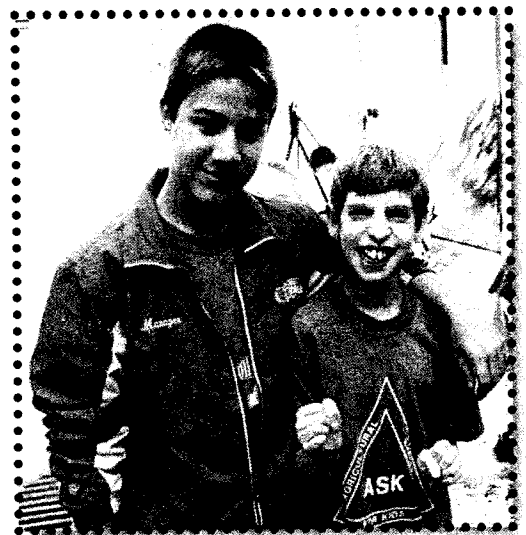
Two CEC members hanging out in the courtyard.

people in our club. Club members will have many opportunities to learn about the differences of others, but more importantly, we hope that they learn about the