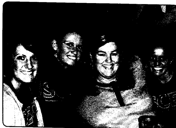
Student KYSCEC Members KYSCEC: Future Leaders of KYSCEC

organization to assist in their "Day at the Races" Indy Car Light Series program for spinal cord injured and their families. The race in KY will be in August this year and it is hoped that our organization can be of help in this worthy project.