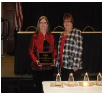
2010 Winner *****