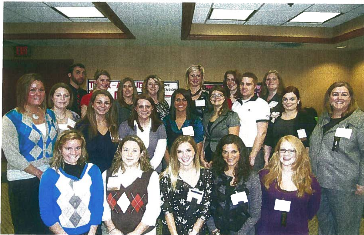
Western Kentucky University Student KYCEC Chapter 2010-2011